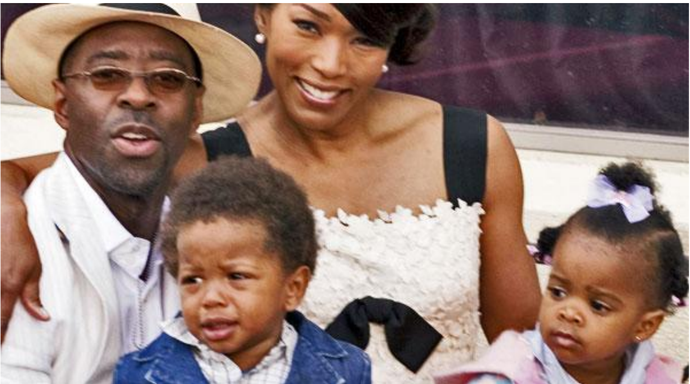
After eight years of marriage, Angela Bassett and Courtney B. Vance welcomed their surrogate-borne twins in January 2006.

Next: Egg donation and surrogacy options